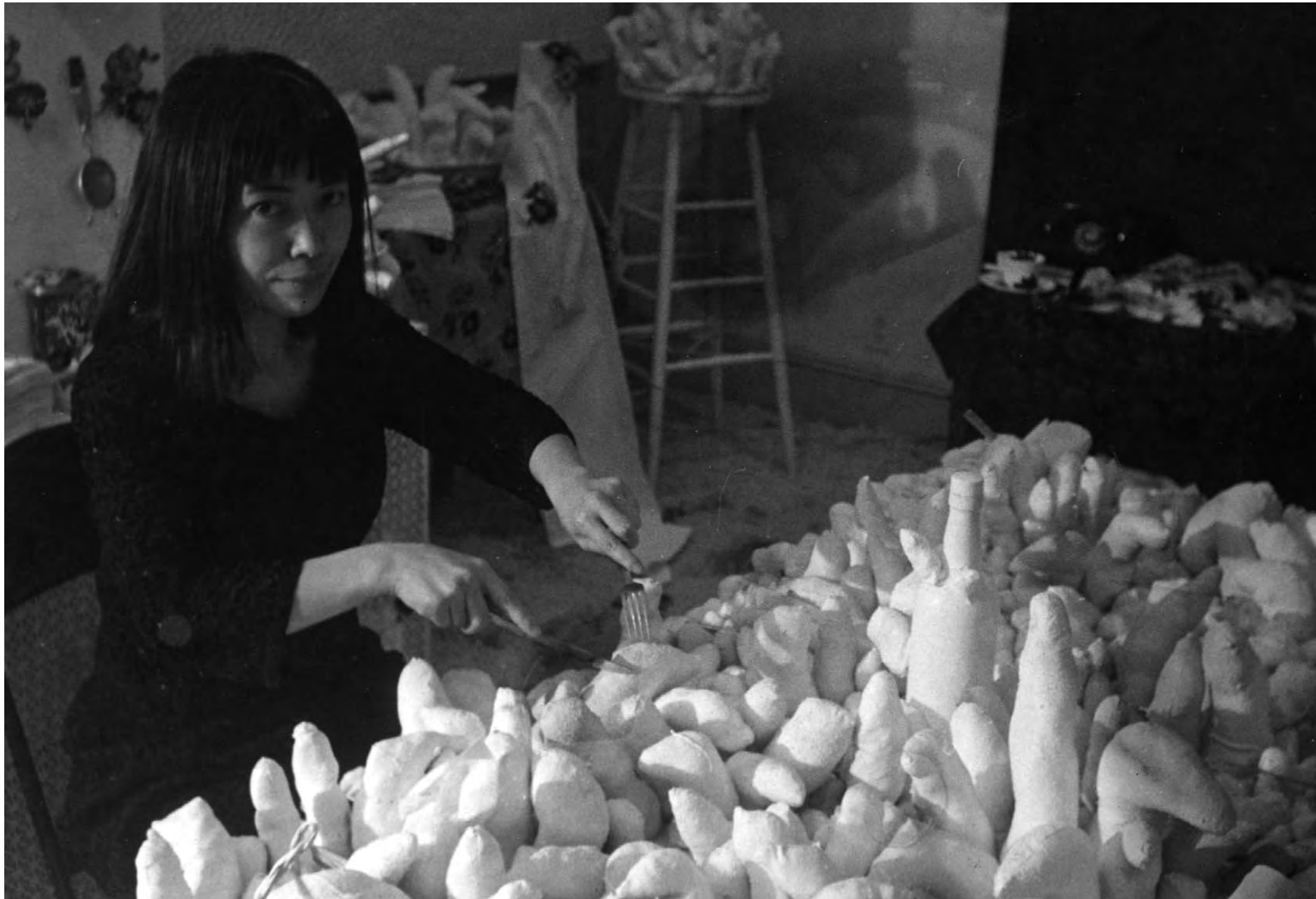
Kusama at Driving Image Show, 1964, Castellane Gallery, New York